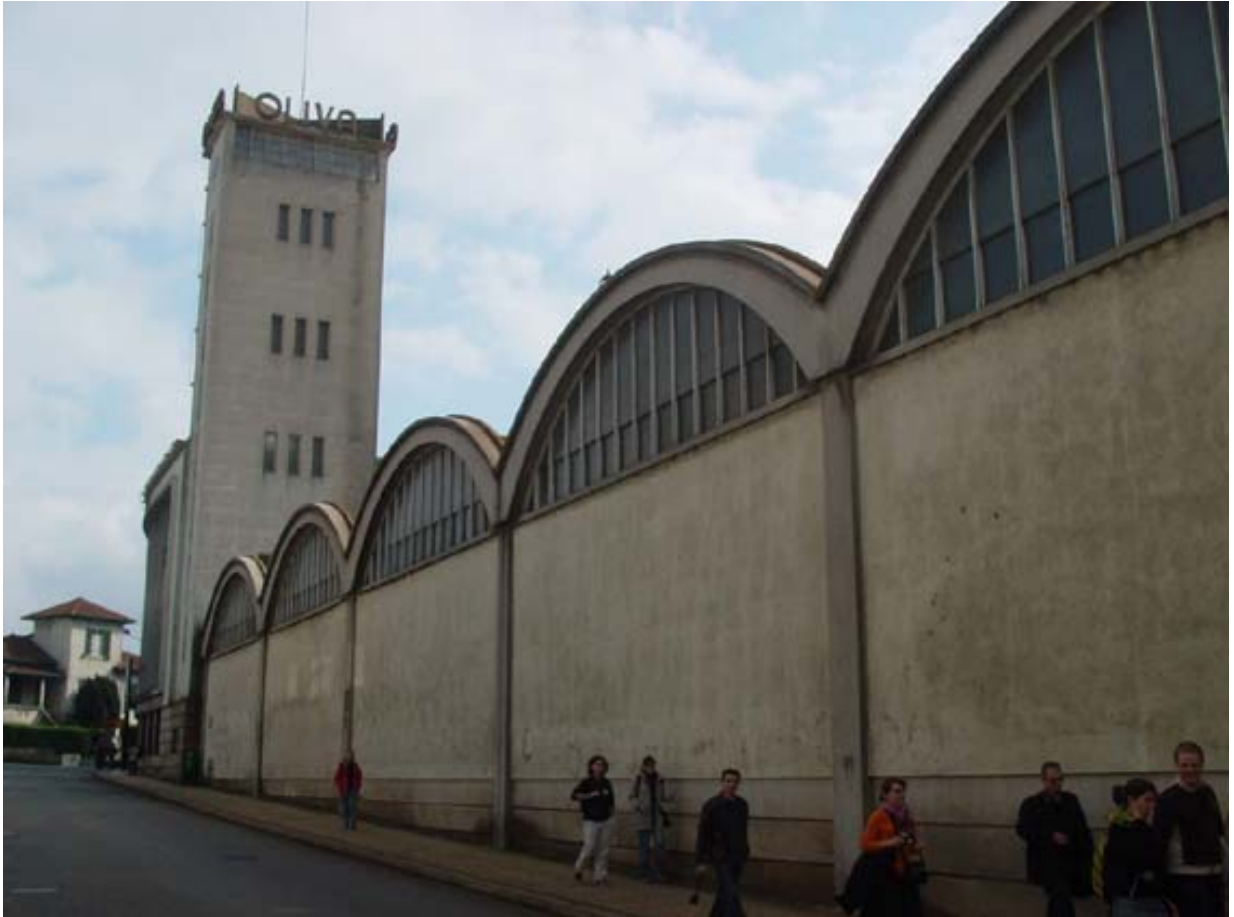
Figure 11 – view NE (see figure 6 to pinpoint this photograph)

– Fragmentation of production stimulated fragmentation of forms: actually the spaces are partially empty and the ones under usage belong to different companies.