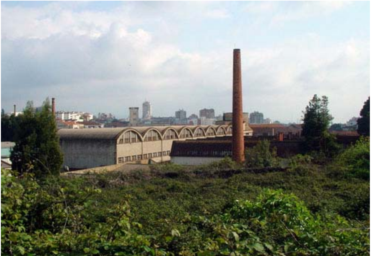
Figure 8 – view NE (see figure 6 to pinpoint this photograph)

- The rural, industrial and urban layers of this territory.